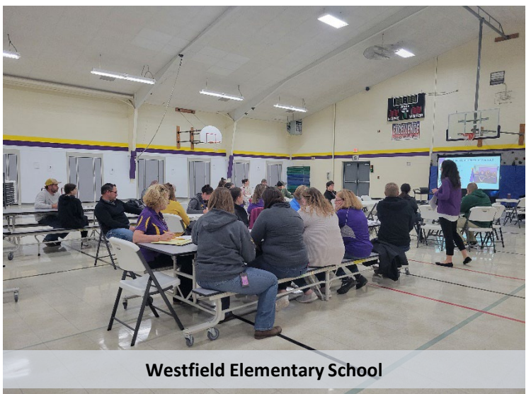
Westfield Elementary School