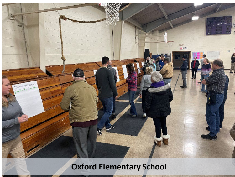
Oxford Elementary School

Over the next few months, the district, Findorff, and Somerville will compile, review, and use the feedback we received to develop potential solution(s) that address priority facility needs. These potential solution(s) will be presented during the February Community & Staff Conversations on Facility Needs . We will also be bringing potential costs for the solution(s) to help our stakeholders further refine their priorities compared to the potential tax impacts.